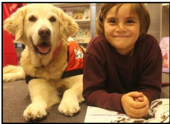
Do not care if a child makes a mistake