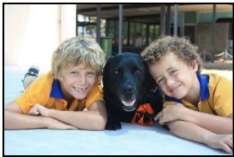
Make reading fun!