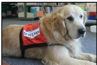
Do not judge

Story Dogs is a reading support program designed to improve the literacy skills of children – using dogs!